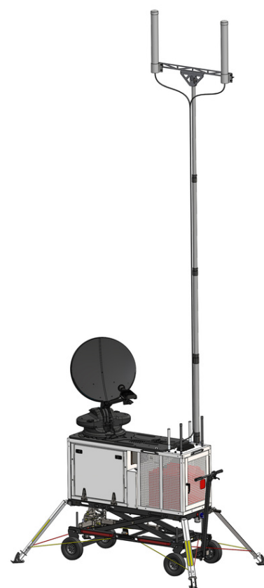
Mast shown in deployed position

FirstNet® is a registered trademark of FirstNet Authority. Copyright © 2021 by Rescue 42, Inc. All Rights Reserved.